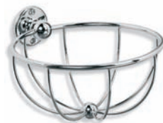
LB 4506 CLASSIC CIRCULAR REAL SPONGE BASKET