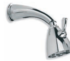
LB 1771 CLASSIC EIGHT JET BRUNSWICK ADJUSTABLE HEAD WITH SHOWER ARM