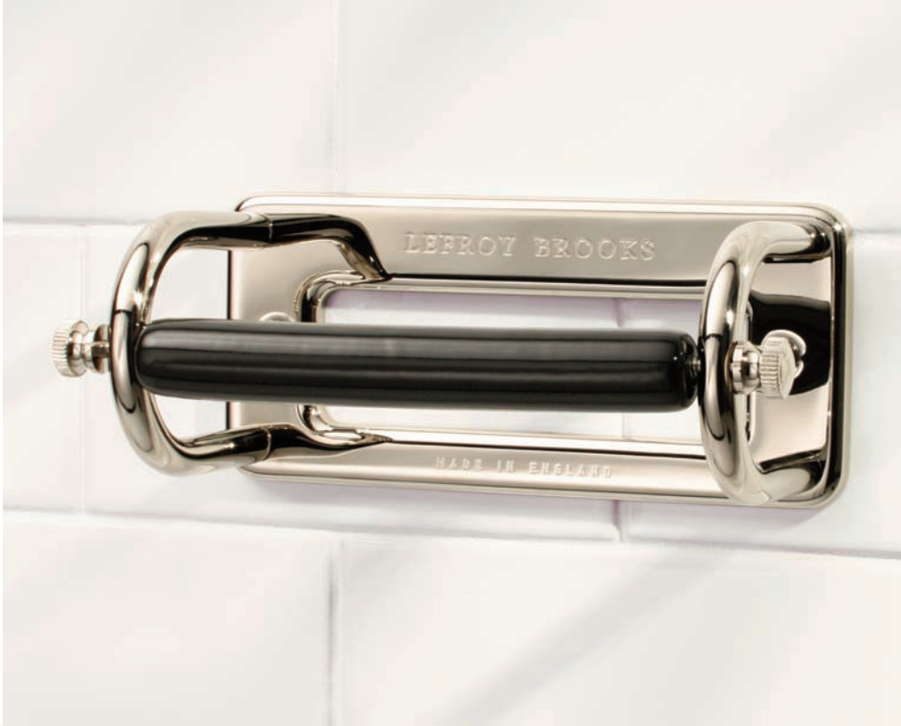
Above: BK 4500 Black Ceramic Paper Holder.