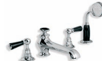
BL 1250 CLASSIC BLACK LEVER FOUR HOLE BATH SET WITH DIVERTER AND PULL-OUT SHOWER