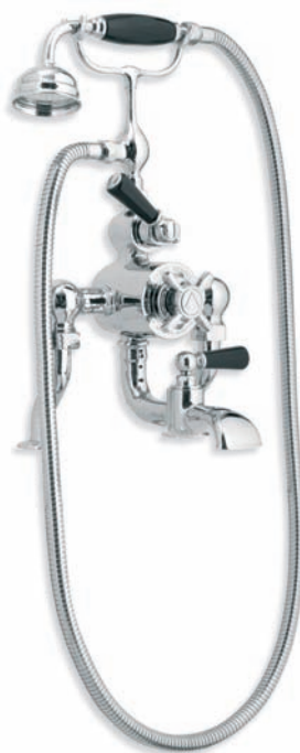
BL 8823 EXPOSED BLACK LEVER GODOLPHIN THERMOSTATIC BATH AND SHOWER VALVE WITH CLASSIC HANDSET