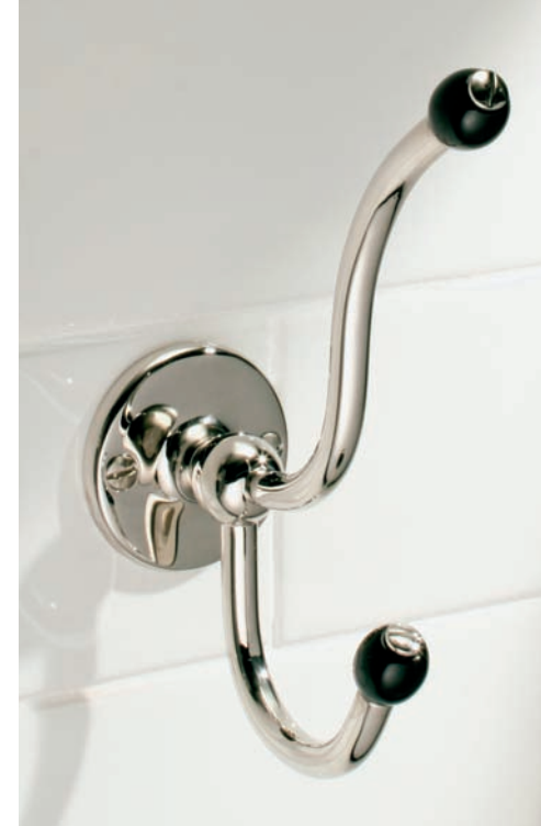
Left: BK 4511 Double Robe Hook with Black Ceramic Acorns.