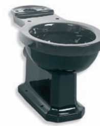
BK 7207 CLASSIC BLACK CLOSE COUPLED PAN