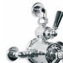
BL 8725 EXPOSED BLACK LEVER GODOLPHIN THERMOSTATIC MIXING VALVE WITH TOP RETURN BEND