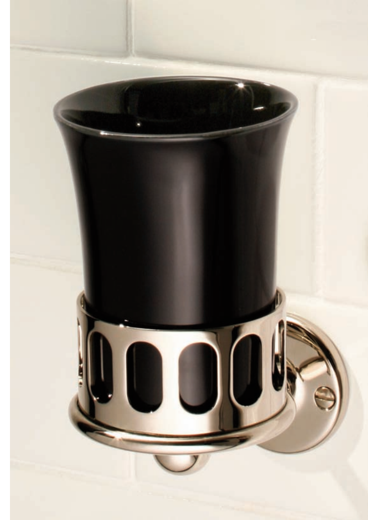
Above: BK 4502 Classic Black Fine Bone China Mug and Holder.