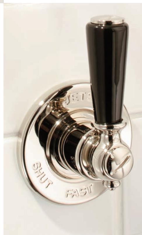
Finishes – Silver Nickel, Chrome, Antique Gold and Satin Nickel.