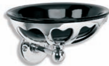
BK 4505 CAST BRASS SOAP HOLDER WITH BLACK FINE BONE CHINA DISH