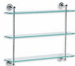
LB 4518 THREE TIER GLASS SHELF

ALL PRODUCTS ARE AVAILABLE IN SILVER NICKEL, CHROME, ANTIQUE GOLD OR SATIN NICKEL FINISHES