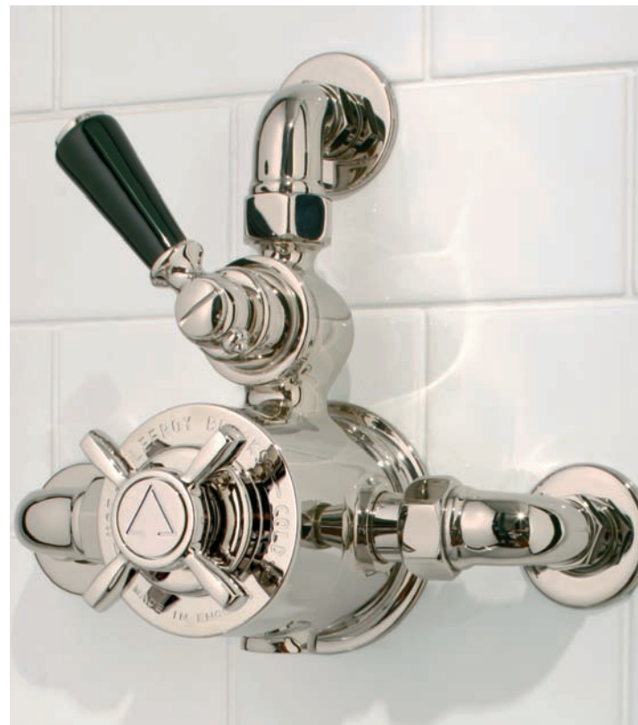
Finishes – Silver Nickel, Chrome, Antique Gold and Satin Nickel.