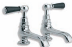
BL 8030 CLASSIC BLACK LEVER LONG NOSE BASIN PILLAR TAPS (1 PAIR) (ALSO AVAILABLE BL 8054 BATH PILLAR TAPS - 1 PAIR)