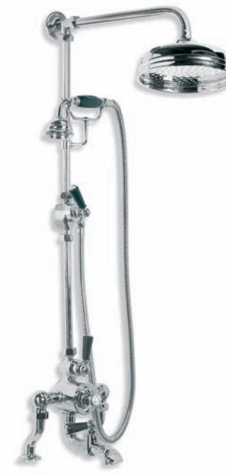
BL 8825 EXPOSED BLACK LEVER THERMOSTATIC BATH AND SHOWER VALVE WITH RISER KIT, HANDSET, LEVER DIVERTER AND 8" ROSE (ALSO AVAILABLE BL 8824 WITH 5" ROSE)