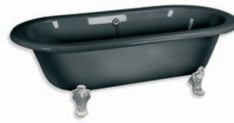
BK 8623 SUPER SIZE DOUBLE ENDED BATH IN BLACK L77" x W37.5" x H24" INCL FEET (L1950 x W950 x H610 MM)