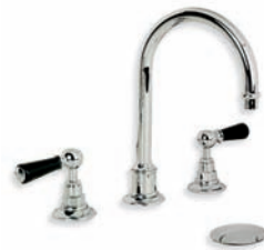
BL 1230 TUBULAR BLACK LEVER THREE HOLE BASIN MIXER WITH CLICK-UP WASTE