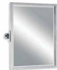
LB 4509 CLASSIC TILTING MIRROR WITH BEVELLED GLASS