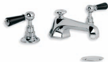
BL 1228 MACKINTOSH BLACK LEVER THREE HOLE BASIN MIXER WITH POP-UP WASTE