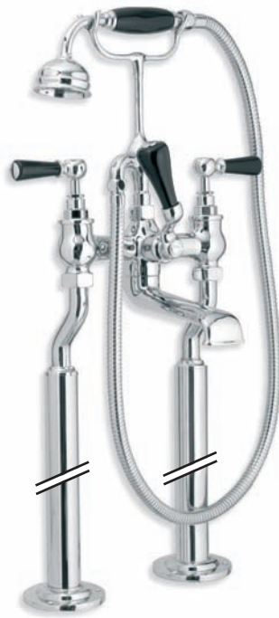
BL 1144 CLASSIC BLACK LEVER BATH SHOWER MIXER WITH STANDPIPES (ALSO AVAILABLE BL 1145 WITH ADJUSTABLE STANDPIPES FOR MOUNTING UNDER BATH RIM)