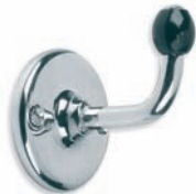
BK 4512 SINGLE ROBE HOOK WITH BLACK CERAMIC ACORN