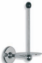
BK 4501 SPARE PAPER HOLDER WITH BLACK CERAMIC ACORN