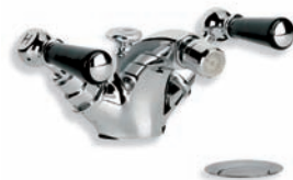
BL 1195 CLASSIC BLACK LEVER BIDET MONOBLOC WITH POP-UP WASTE (ALSO AVAILABLE BL 1185 BASIN MONOBLOC WITH POP-UP WASTE)