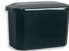
BK 7208 CLASSIC BLACK CLOSE COUPLED CISTERN WITH SIDE FLUSH (REQUIRES CISTERN FITTINGS LB 7299)