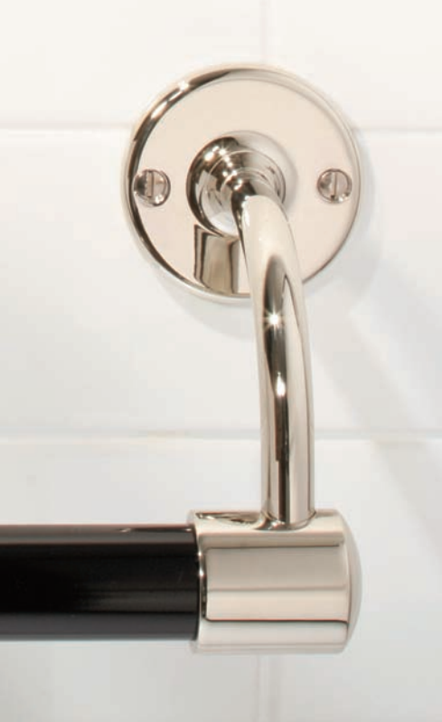
Left: BK 4507 Classic Large Bore (1") Black Stove Enamelled Towel Bar with Large Backplates (Standard 20" Length), BK 4508 for Extra Long 30".