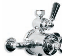
BL 8700 EXPOSED BLACK LEVER GODOLPHIN THERMOSTATIC MIXING VALVE