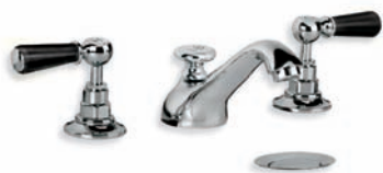
BL 1216 EDWARDIAN BLACK LEVER THREE HOLE BASIN MIXER WITH POP-UP WASTE