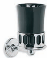
BK 4502 BLACK FINE BONE CHINA MUG AND HOLDER