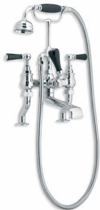
BL 1100 CLASSIC BLACK LEVER BATH SHOWER MIXER DECK MOUNTED (ALSO AVAILABLE BL 1166 WALL MOUNTED)