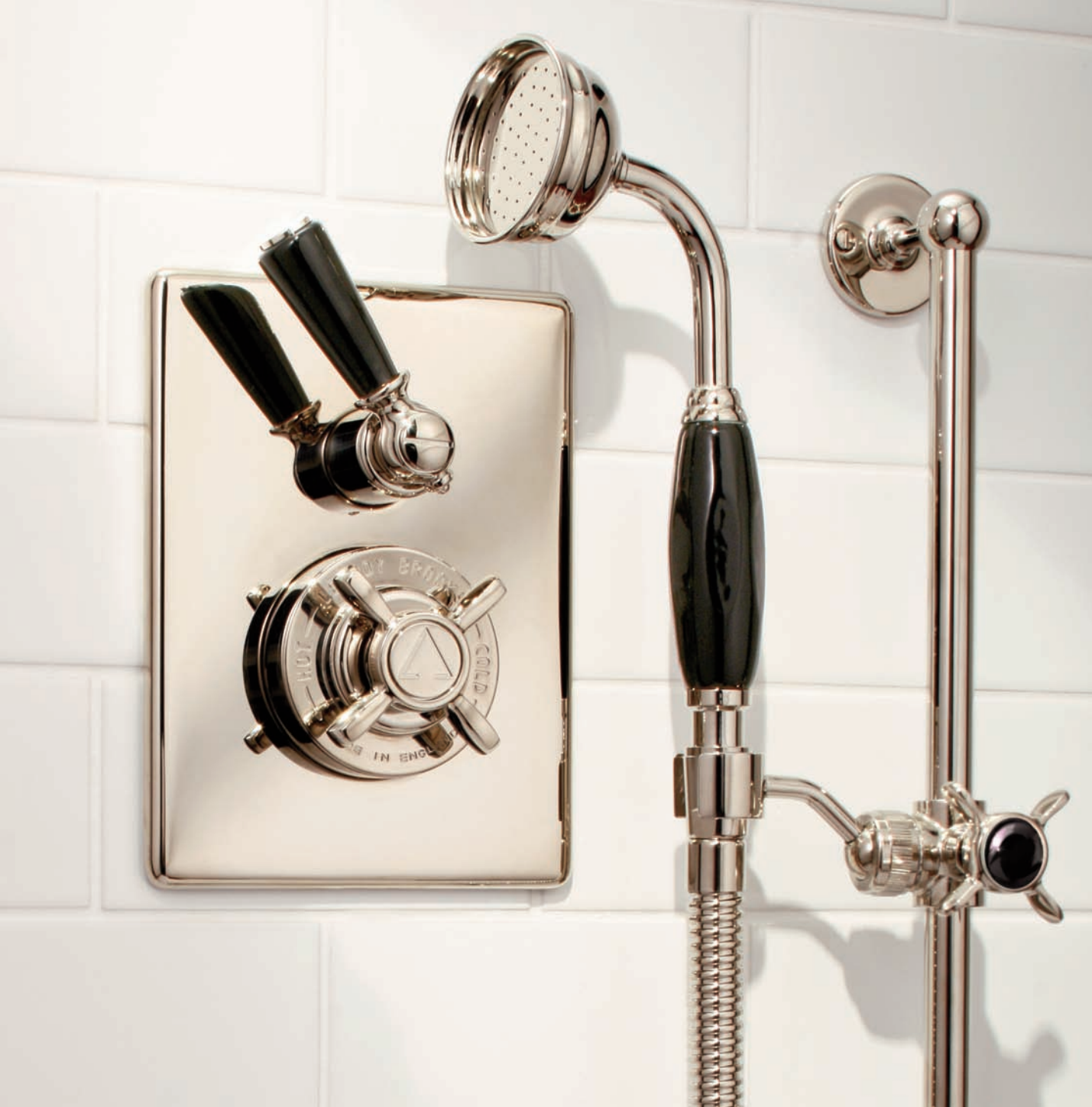
Above: BL 8717 Concealed Black Lever Thermostatic Mixing Valve with Sliding Rail and Handset.