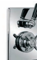
BL 8706 CONCEALED BLACK LEVER GODOLPHIN THERMOSTATIC MIXING VALVE