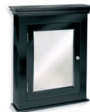
BK 3701 LARGE CLASSIC MEDICINE CABINET IN BLACK