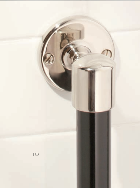
Left: BK 4513 Black Stove Enamelled Grab Bar (15") with Large Backplates.