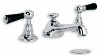
BL 1220 CLASSIC BLACK LEVER THREE HOLE BASIN MIXER WITH POP-UP WASTE