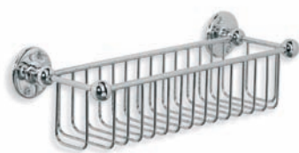
LB 4510 CLASSIC WIRE CORNER SOAP DISH RACK