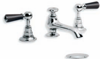
BL 1224 CONNAUGHT BLACK LEVER THREE HOLE BASIN MIXER WITH POP-UP WASTE