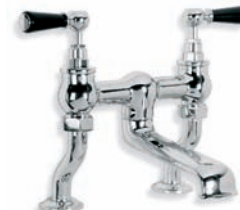
BL 1107 CLASSIC BLACK LEVER BATH FILLER DECK MOUNTED (ALSO AVAILABLE BL 1151 FOR WALL MOUNTING)