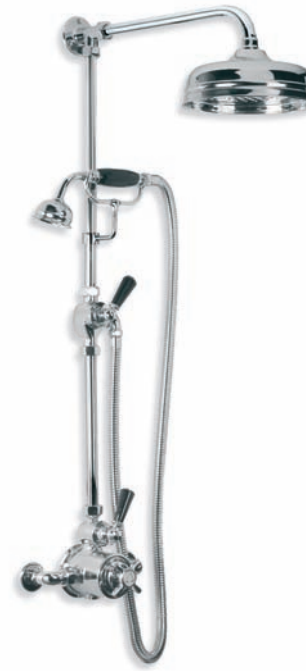
BL 8704 EXPOSED BLACK LEVER THERMOSTATIC VALVE WITH RISER KIT, HANDSET, LEVER DIVERTER AND 8" ROSE (ALSO AVAILABLE BL 8703 WITH 5" ROSE)