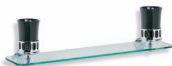
BK 4517 GLASS SHELF WITH TWIN FINE BONE BLACK CHINA MUGS