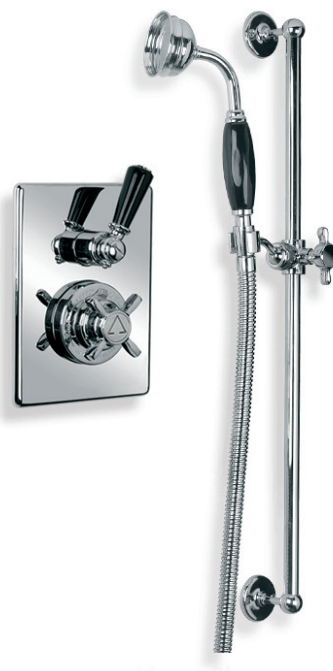
BL 8717 CONCEALED BLACK LEVER THERMOSTATIC MIXING VALVE WITH SLIDING RAIL AND HANDSET