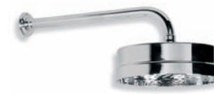
MK 1774 MACKINTOSH 8" APRON ROSE WITH SHORT ARM (SUITABLE FOR CUBICLE) ALSO AVAILABLE LB 1774 CLASSIC ROSE - SEE PICTURE BELOW