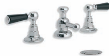
BL 1461 CLASSIC BLACK LEVER BIDET THREE HOLE WITH ASCENDING SPRAY AND POP-UP WASTE