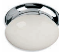
LB 4004 CLASSIC CEILING LIGHT WITH 10" OVAL OPAL GLOBE