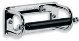
BK 4500 BLACK CERAMIC PAPER HOLDER