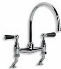
BL 1517 BLACK LEVER BRIDGE MIXER WITH 9" SPOUT (ALSO AVAILABLE BL 9007 WITH 6.5" SPOUT)