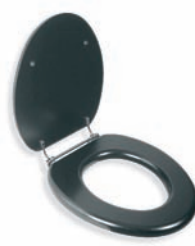
LB 7242 CLASSIC BLACK LAVATORY SEAT WITH BAR HINGE