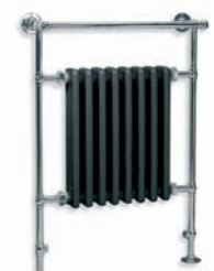
BK 3202 CLASSIC BALL JOINTED CAST IRON RADIATOR IN BLACK H37.5" x W26.5" x D8" (H953 x W669 x D205 MM)