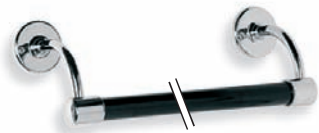
BK 4507 BLACK LARGE BORE (1") STOVE ENAMELLED TOWEL RAIL (STANDARD 20") ALSO AVAILABLE BK 4508 LONG 30"