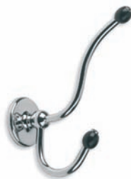
BK 4511 DOUBLE ROBE HOOK WITH BLACK CERAMIC ACORNS