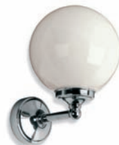
LB 4000 CLASSIC SINGLE WALL BRACKET WITH 6" OPAL GLOBE