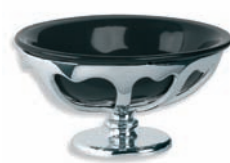
BK 4515 FREESTANDING SOAP DISH HOLDER WITH BLACK FINE BONE CHINA DISH