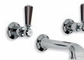
BL 1152 CLASSIC BLACK LEVER CONCEALED WALL BATH FILLER (ALSO AVAILABLE BL 1212 WALL MOUNTED BASIN FILLER)