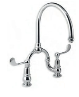
FL 1530 LA CHAPELLE DECK MOUNTED LEVER KITCHEN MIXER (LEVER HANDLES ARE AVAILABLE ON OTHER PRODUCTS BY REQUEST)