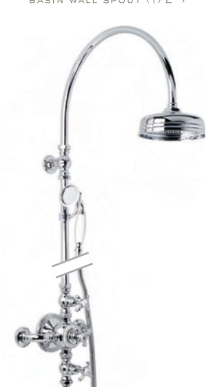
FR 8620 EXPOSED THERMOSTATIC VALVE AND RISER KIT, HANDSET & RISER CRADLE AND 8" ROSE