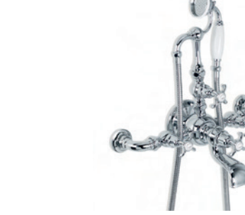
FH 1146 LA CHAPELLE WALL MOUNTED BATH SHOWER MIXER 22MM (3/4")