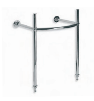
LB 3227 BALL JOINTED STAND FOR LA CHAPELLE BASIN (72CM) (THE FULL RANGE OF TUBULAR STANDS ARE SHOWN IN OUR CHINAWARE BROCHURE)