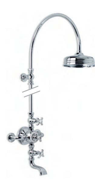
FR 8630 LA CHAPELLE EXPOSED THERMOSTATIC SHOWER WITH 8" ROSE AND BATH FILL