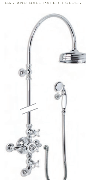
FR 8615 EXPOSED THERMOSTATIC VALVE WITH WALL RETURN & RISER KIT, HANDSET AND WALL CRADLE AND 8" ROSE