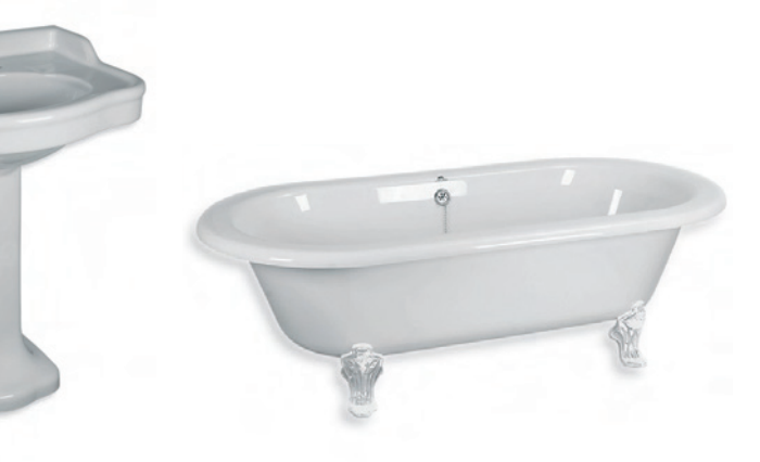
LB 7703 WITH LB 7704 LB 8623 LA CHAPPELLE THREE HOLE CHATEAU SUPER SIZE BASIN (57CM) WITH PEDESTAL BIGGER, WIDER, DEEPER (THE FULL RANGE OF BASINS ARE SHOWN DOUBLE ENDED BATH IN OUR CHINAWARE BROCHURE)