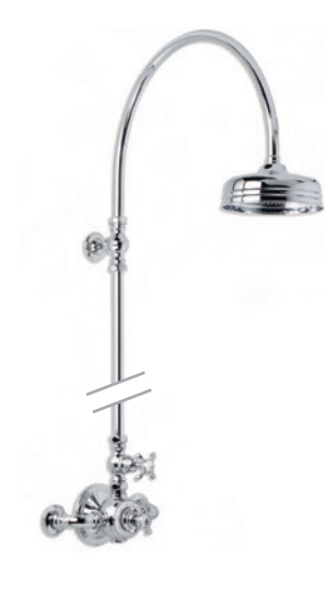
LA CHAPELLE EXPOSED THERMOSTATIC SHOWER VALVE WITH RISER AND 8" ROSE.