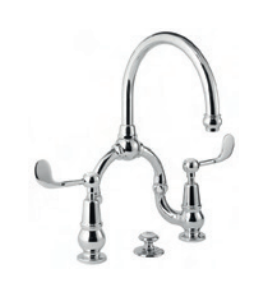
FL 9000 LA CHAPELLE BASIN BRIDGE MIXER WITH LEVER & POP-UP WASTE (LEVER HANDLES ARE AVAILABLE ON OTHER PRODUCTS ON REQUEST)