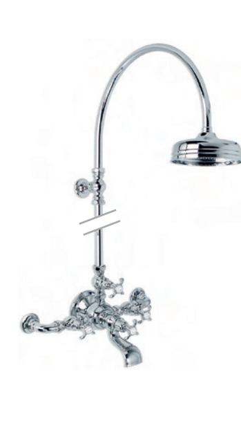
FH 1156 LA CHAPELLE WALL MOUNTED BATH SHOWER MIXER WITH RISER AND 8" ROSE