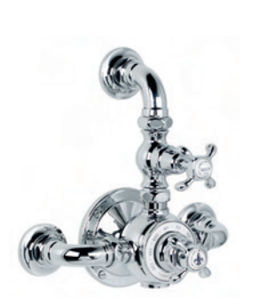
FR 8625 EXPOSED DUAL CONTROL LA CHAPELLE THERMOSTATIC MIXING VALVE WITH TOP RETURN BEND TO WALL FOR CONCEALED SHOWER OUTLET