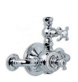
FR 8600 EXPOSED DUAL CONTROL LA CHAPELLE THERMOSTATIC MIXING VALVE