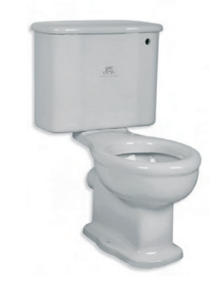
LB 7707 WITH LB 7708 LA CHAPPELLE CLOSE COUPLED PAN WITH CISTERN (THE FULL RANGE OF SANITARY WARE IS SHOWN IN OUR CHINAWARE BROCHURE)